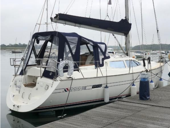
Southerly 110 Peridot