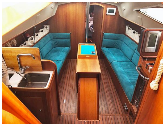
Light and airy interior