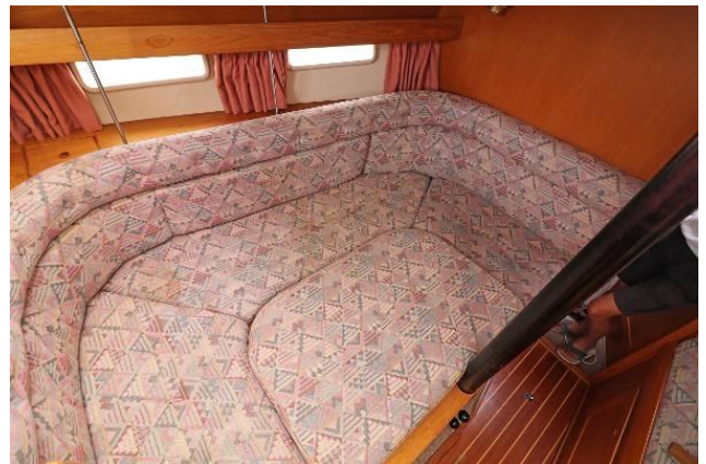
Port seating converts to double berth