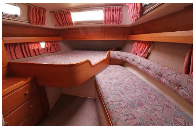
Aft cabin seating